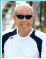
NICK BOLLETTIERI, Tennis Icon, 2014 International Tennis Hall of Fame, ICT Board Member