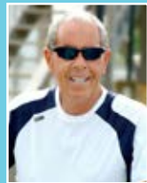
NICK BOLLETTIERI , Tennis Icon, 2014 International Tennis Hall of Fame, ICT Board Member

We start by providing excellent on-court coaching and programs for every age and every ability, from the youngest first-time beginners to our seasoned tournament players. A player can enter at any stage along the ICT Player Pathway and find a place to learn, improve, and have tons of fun.