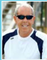
NICK BOLLETTIERI, Tennis Icon, 2014 International Tennis Hall of Fame, ICT Board Member