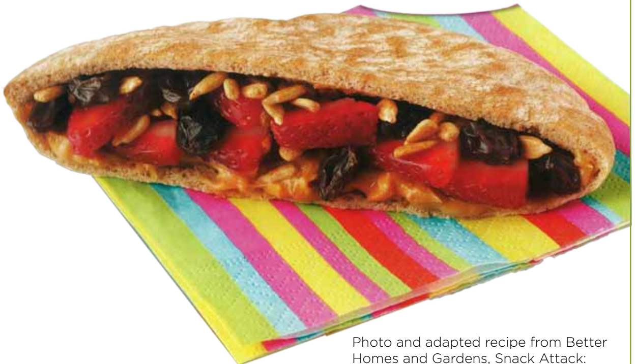
Photo and adapted recipe from Better Homes and Gardens, Snack Attack: Return of the Munchies.

This is a quick and easy hand-held meal or snack that can be “taken along” as you complete your holiday errands or travel to celebrate the season with family and friends!